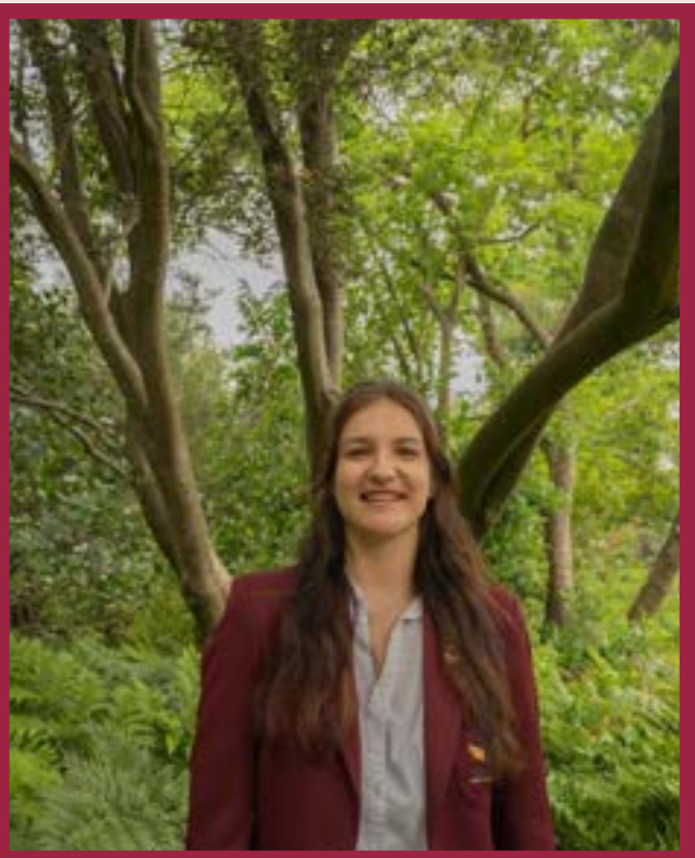
Critical Engagement | Sustainability