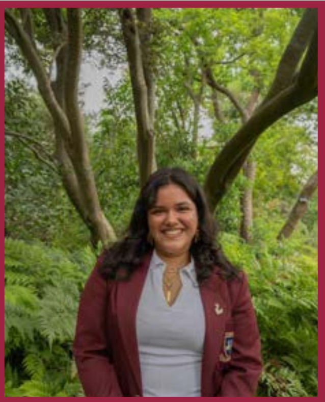
Social Media | Branding