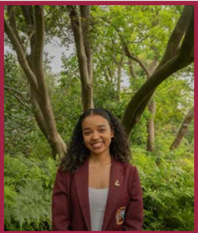
Social Impact | Seniors