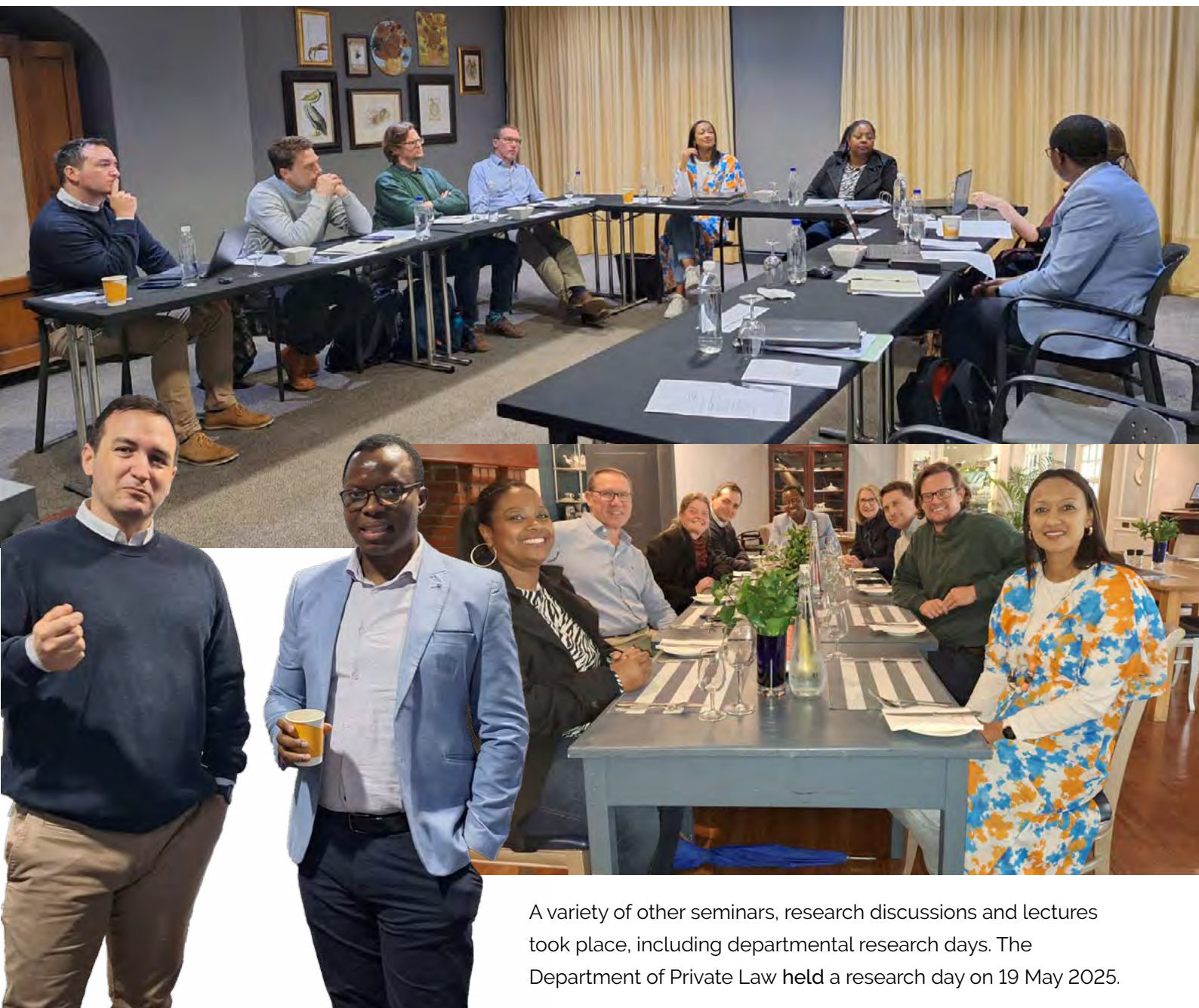
A variety of other seminars, research discussions and lectures took place, including departmental research days. The Department of Private Law held a research day on 19 May 2025.