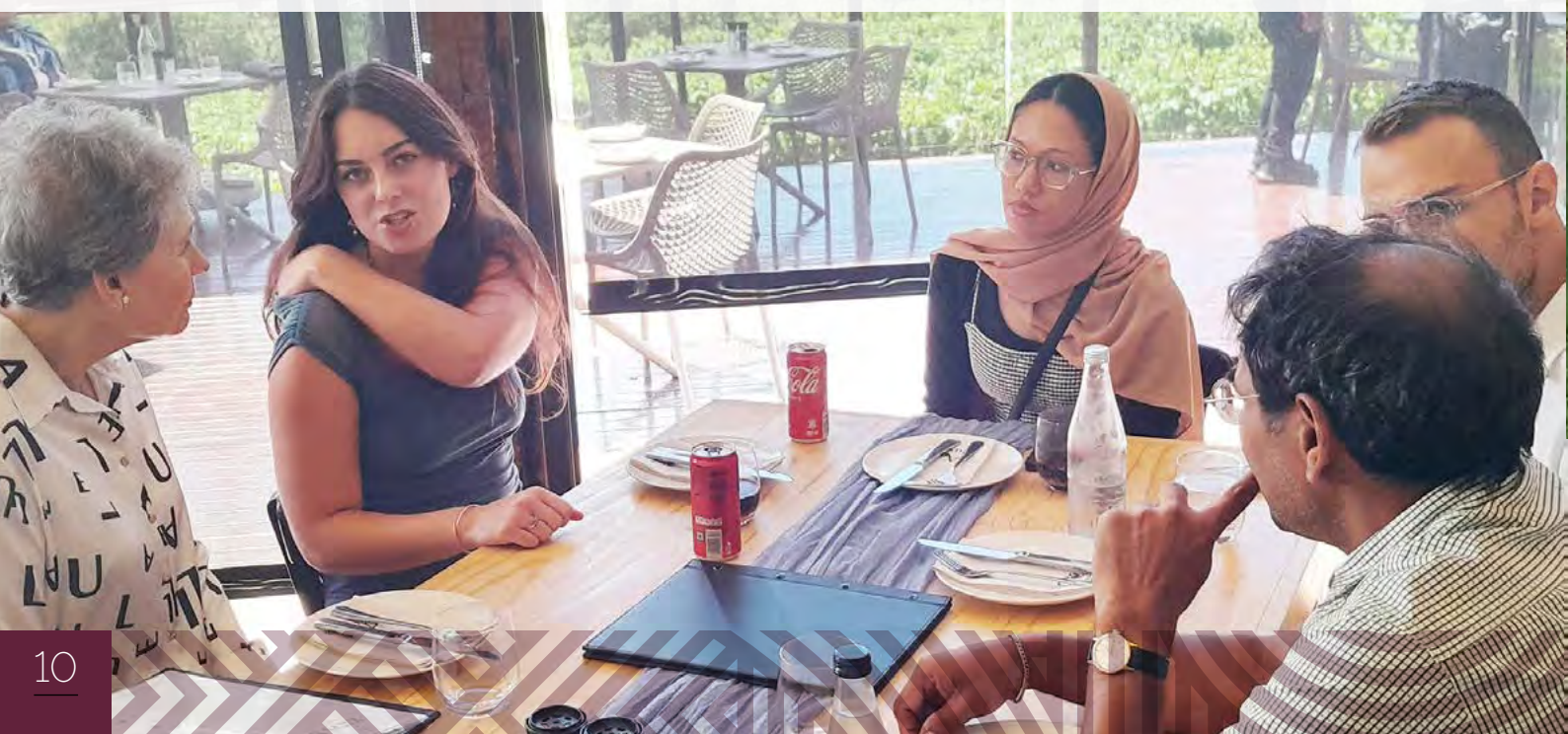
Department of Mercantile Law's first research seminar.