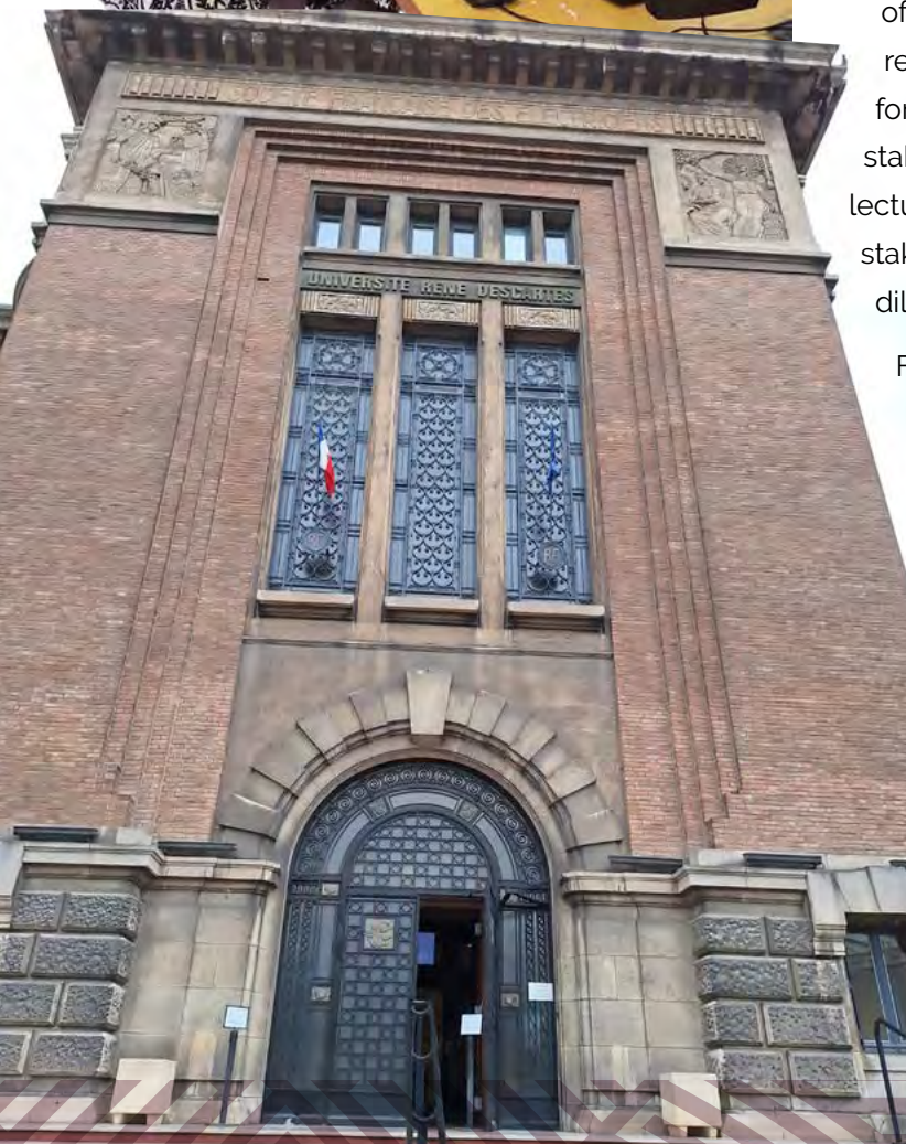
Faculty of Law, Université Paris Cité