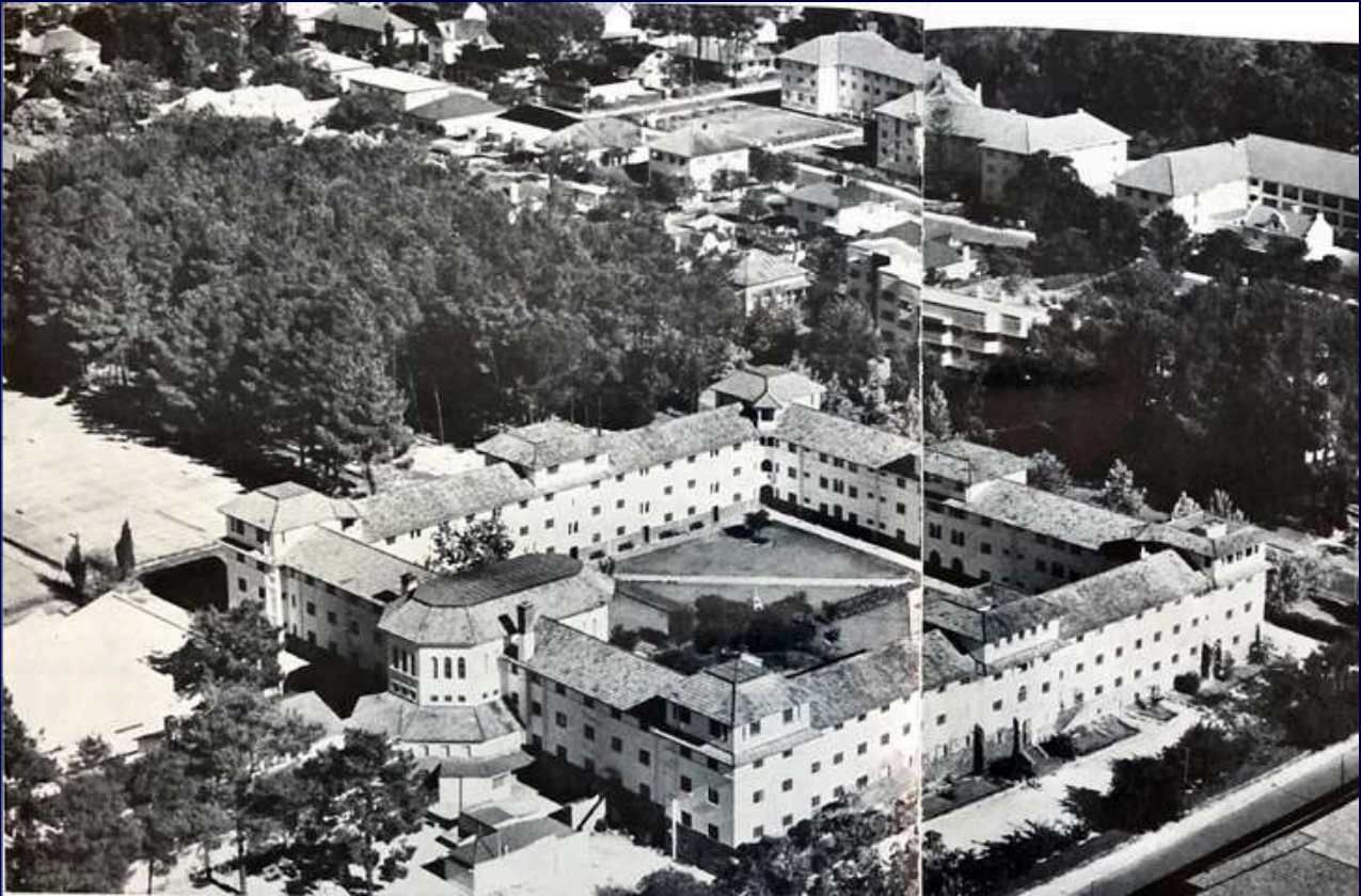
Aerial Photo of Dagbreek in the 1900's

"The year is 1918. The Victoria College's status has just been increased to that of a university and was from then on known as the University of Stellenbosch. An acute housing shortage was quickly identified as prospective students from all over the South Africa came rushing to Stellenbosch for higher academic teaching. In 1920 the building process of the first seven sections of Dagbreek started which if viewed from above would have looked like the shape of the letter L, known to students as 'The New Residence' (Die Nuwe Koshuis). Students started moving into the residence even before the construction of the building had finished at the end of 1921.