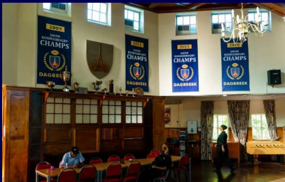
Bethuel Sibuta Dining Hall

Football, Rugby, Hockey, Cricket, Tennis, Waterpolo, Golf, Athletics, Ultimate Frisbee, Tabletennis, Squash, Swimming, Chess, Eiffelchoir, Molassesêr, Drama, Debating, Basketball