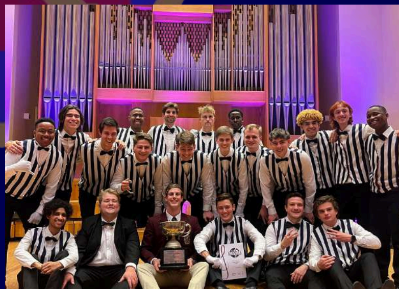
Dagbreek Eiffel Choir 2024 (Winners of the Stellenbosch University Acapella Competition for a third year in a row)