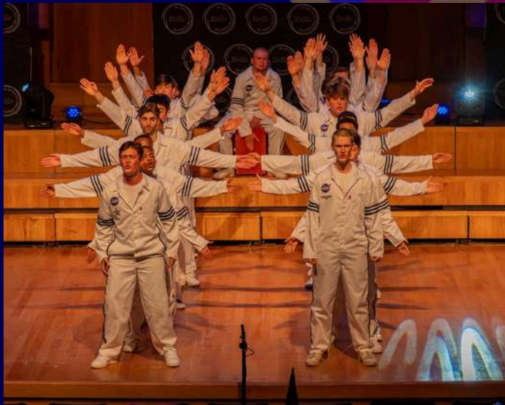
Dagbreek Eiffel Choir in Action

Come Dagbreek let your glory strengthen In light of shining day Join all as one to greater fame Uphold and glorify our name!