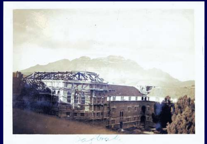
The construction of the dining hall in August 1927

This system did not work very well and in 1925 they began building Section 8 to 18. The new sections included a dining hall and a recreation hall.