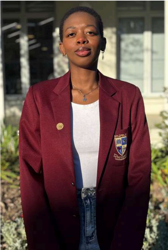
Senate Tladi Primaria