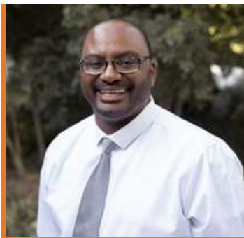
Cluster Education Coordinator