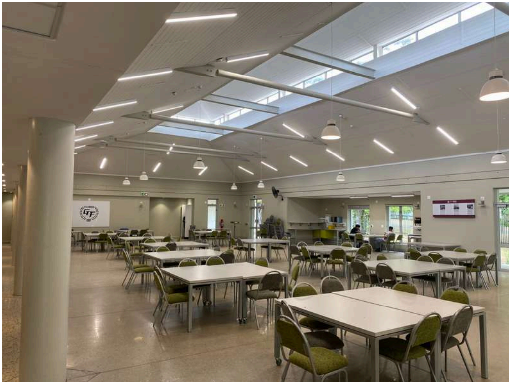
Sada Oms - Our Dining Hall