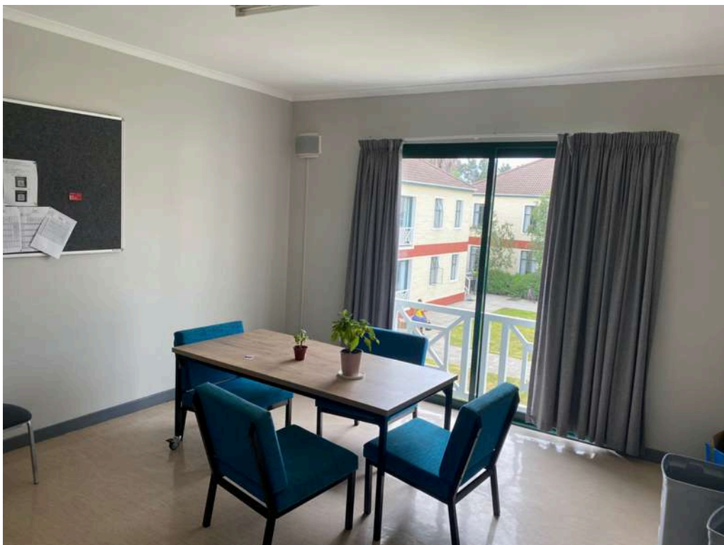
A Standard Block Common Room