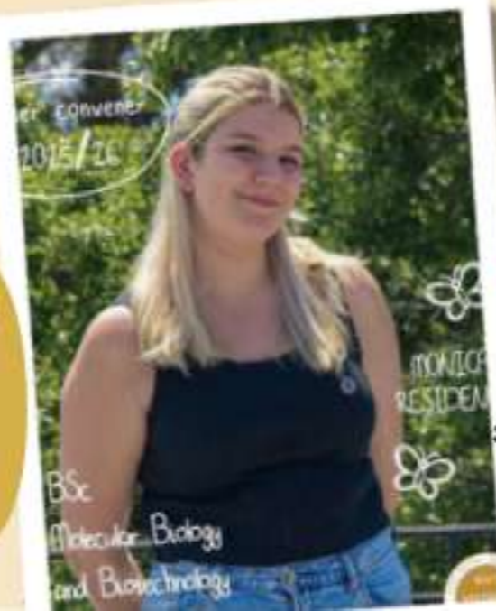
she is from Monica 🦋